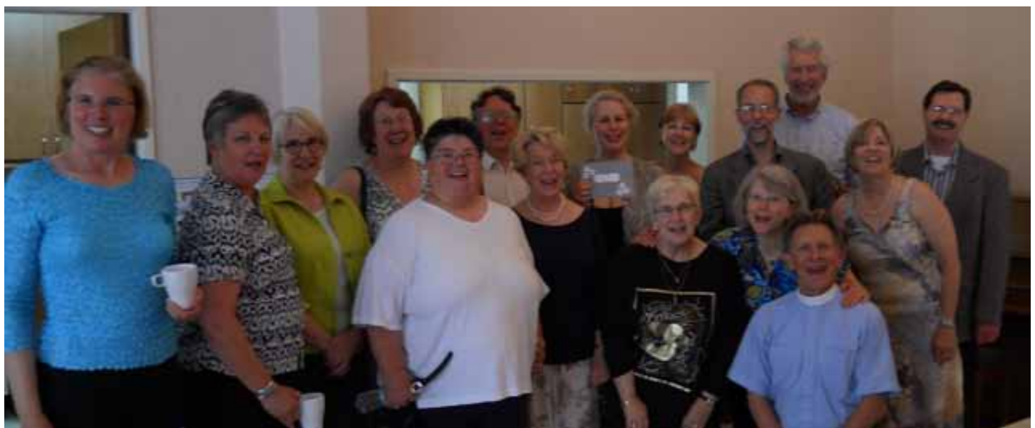
The choir was last seen in late June celebrating a successful season.