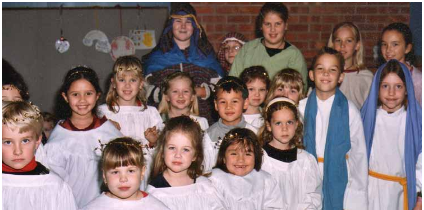
From the archives: Christmas Eve 2001